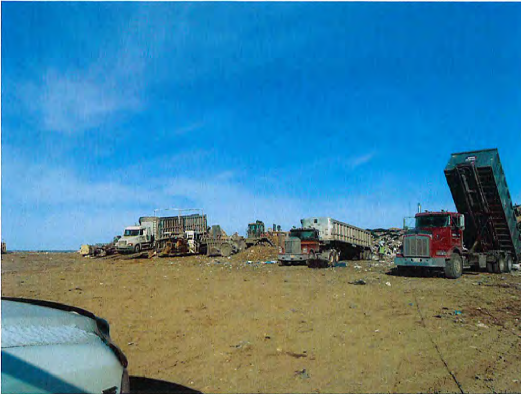
Date: 12-18-13 Time: 1230 Direction: northwest Exposure #: 001 Comments: Photograph depicts the active face, of the landfill, located in Phase 5, Cell 2 West.