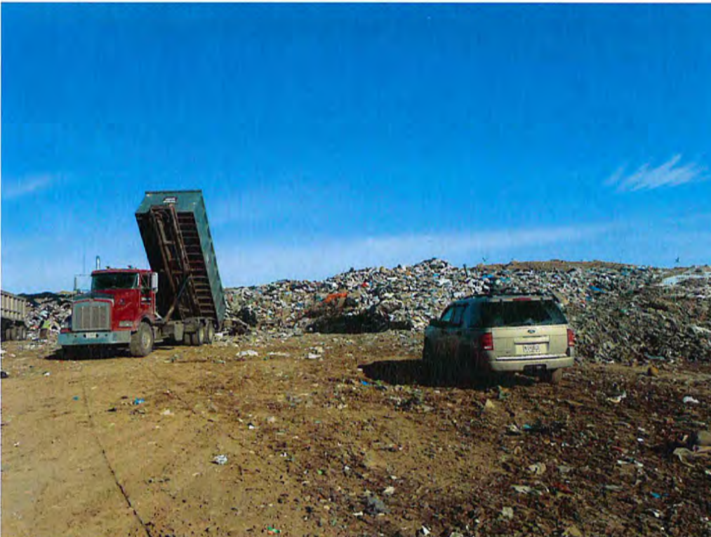
Date: 12-18-13 Time: 1230 Direction: northeast Exposure #: 002 Comments: Photograph depicts the active face, of the landfill, located in Phase 5, Cell 2 West.